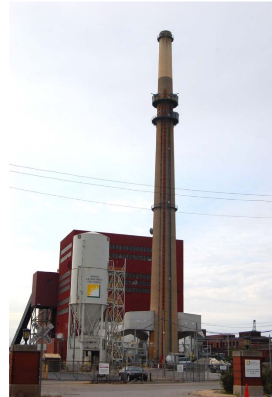
Fisk Coal Plant