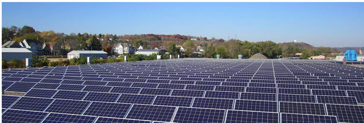
Solar on a municipal building in Dubuque, IA.

Renewable energy purchases can benefit more than just the environment. Eaton Rapids, MI developed a solar array on an old landfill , generating power for its municipal utility and putting contaminated land back to use. Urbana, IL hosted a solar group buy that helped residents and businesses go solar by reducing costs through bulk purchasing. Investing in renewables locally – by adding solar panels to municipal property, participating in community solar projects, or purchasing energy from new, nearby renewable projects – can also benefit the local economy. A variety of mechanisms are available to do this.