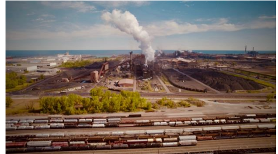
Cleveland-Cliffs Burns Harbor facility

Cleveland-Cliffs operates two steel mills in Northwest Indiana, in Burns Harbor and East Chicago's Indiana Harbor. After years of permit violations, the Burns Harbor mill had a particularly disastrous discharge in 2019 of ammonia and cyanide that killed 3,000 fish and closed Indiana beaches. ELPC and the Hoosier Environmental Council filed a Clean Water Act lawsuit and won! In 2022, we reached a successful settlement that will help prevent such a disaster from happening again and secure additional land for the neighboring Indiana Dunes National Park. We have continued to keep our eye on Cleveland-Cliffs facilities ever since.