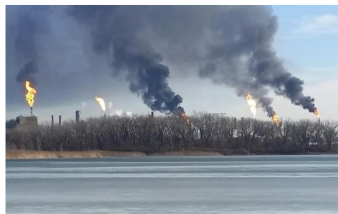
BP Whiting Refinery flares & smoke, Feb 2024

In February 2024, a series of leaks caused by equipment failures and a power outage, prompted the plant to shut down and burn off excess product, resulting in increased pollution, sky-high flames, and smoke for miles. ELPC & partners