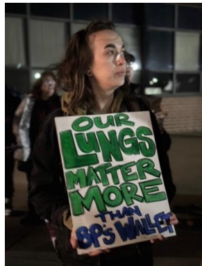
Hoosiers Protest Air Pollution

Coke ovens are a significant source of benzene and other hazardous air pollutants. In 2023, ELPC submitted comments on EPA's proposed revisions to the Coke Oven National Emission Standard for Hazardous Air Pollutants (NESHAP). Fortunately, new stronger standards were finalized in May of 2024, affecting the Gary Works and Burns Harbor facilities, in particular.